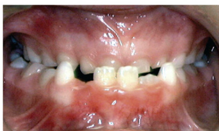
Complete Class III